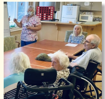
Residents play games.

From the bottom of our hearts, we want to thank you for being an integral part of St. André Health Care.